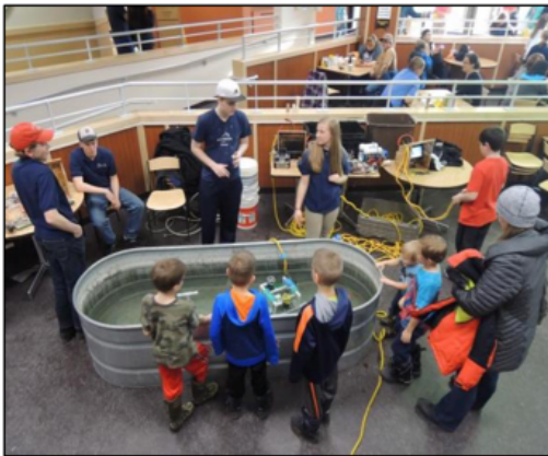
Dollar Bay HS students demonstrate the ROV they designed to families attending the Western UP Science Fair & STEM Festival conducted annually at the Michigan Tech MUB Commons..