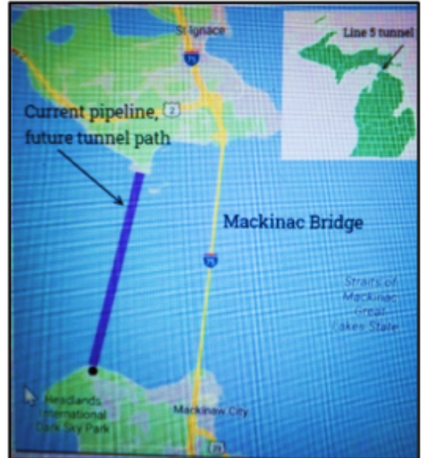
Line 5 pipeline, which crosses the Straits of Mackinac as it transports petroleum products from Wisconsin to Ontario. Tunnel opponents have long called for a shutdown, warning that a rupture would cause a catastrophic oil spill in the straits.

For additional information with comments from various Michigan groups: https://keweenawnow.blogspot.com/2020/11/governor-whitmer-dnr-take-action-to.html Or go to forloveofwater.org & oilandwaterdontmix.org .