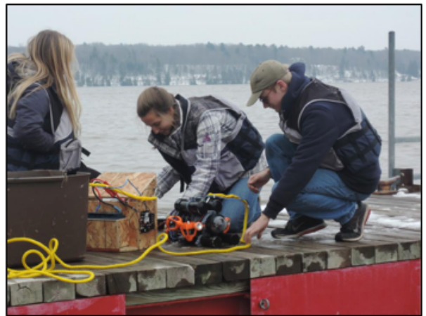
High school students researching local waters using Remotely-Operated Vehicles (ROVs) they designed & built to conduct research below the water's surface.

If you would like more information on this great opportunity for "Connecting Schools and Communities," or would like to donate online, please go to the LSSI website: http://lakesuperiorstewardship.org/ or mail a check to Lake Superior Stewardship Initiative , 809 Hecla St. Hancock, MI 49930.