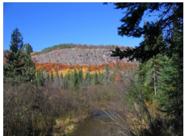
Cascade Creek in the foreground with the highest sheer cliff in Michigan, located in the Trap Hills, one of the four proposed Wilderness Areas. See article next page.

Catalyst Communities (Sept. 2020) – This community program is a comprehensive initiative to provide education, training, planning, and technical resources to local public officials as they prepare for climate impacts on emergency response and public health. "Michigan has seen and continues to experience the lasting effects of climate change and we have a responsibility to do everything in our power to protect Michigan families, environment, and economy," said Governor Whitmer. For more details on Michigan's Healthy Climate Plan go to: https://www.michigan.gov/climateandenergy .